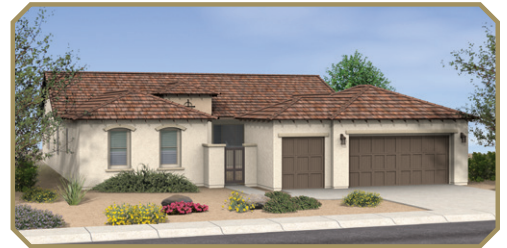
Exterior Design B