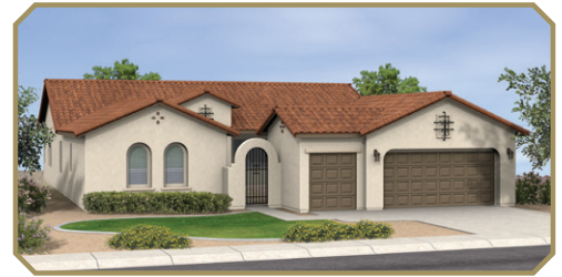
Exterior Design A

Standard Livable Space Optional Livable Space Standard Concrete Areas Optional Concrete Areas