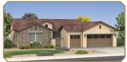
Exterior Design C