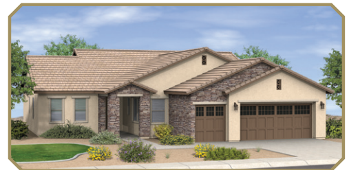
Exterior Design C

Standard Livable Space Optional Livable Space Standard Concrete Areas Optional Concrete Areas