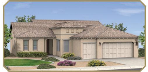
Exterior Design B