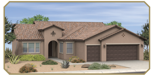
Exterior Design A