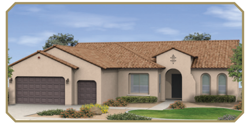
Exterior Design A