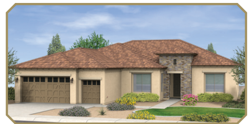
Exterior Design C

Standard Livable Space Optional Livable Space Standard Concrete Areas Optional Concrete Areas