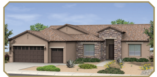
Exterior Design B