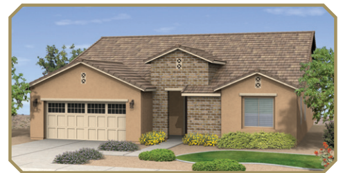
Exterior Design C

Standard Livable Space Optional Livable Space Standard Concrete Areas Optional Concrete Areas