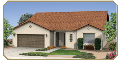
Exterior Design A