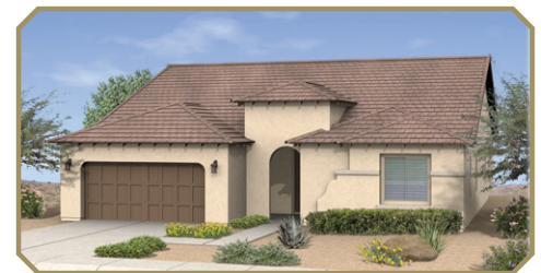
Exterior Design B