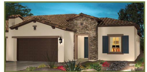
Exterior Design B