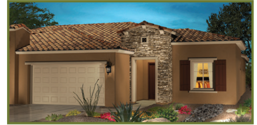
Exterior Design A